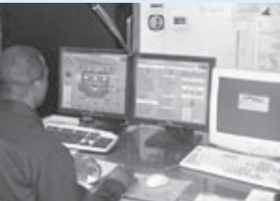
An operator monitors the new computerized control systems.

"In the long run they will help us control fuel costs by ensuring that the boilers run as efficiently as possible," King said. "They are a part of our long-range plan to keep steam a convenient, reliable, affordable energy source in the downtown Detroit area." ■